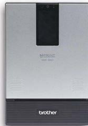
Brother MPrint MW-260MFi Small-format (A6) mobile wireless printer with USB, Bluetooth, and IrDA interfaces.

This ultra-slim, lightweight mobile printer is the ideal solution for applications that demand high-resolution text or graphics in small-format output (2.9"x4.1" or 4.1"x5.8"). Now with MFi Bluetooth® technology and across-the-board operating system compatibility, the MW Series offers easy, wireless communication with iPhone®, iPad®, iPod®, Windows®, Windows Mobile®, and Android™ devices.